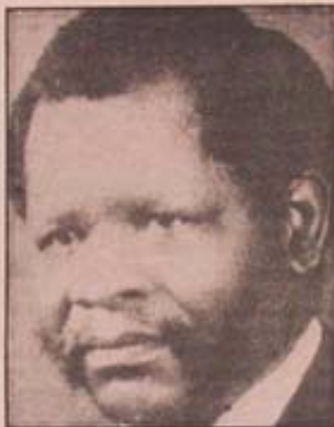
ANC President OLIVER TAMBO.

It is significant that the youth in particular are all over, in the churches, among the workers, in the national liberation movement, the political organizations and as far as the ANC is concerned they serve at all levels—in all sectors of our activity. They fill positions of command and authority in our army. They sit in the planning units, they are at the battlefield, they are our administrators, they engage in international solidarity work and in this way they have given tremendous youthfulness to the ANC. That situation bodes well for the future, and I'm not talking about a remote future.