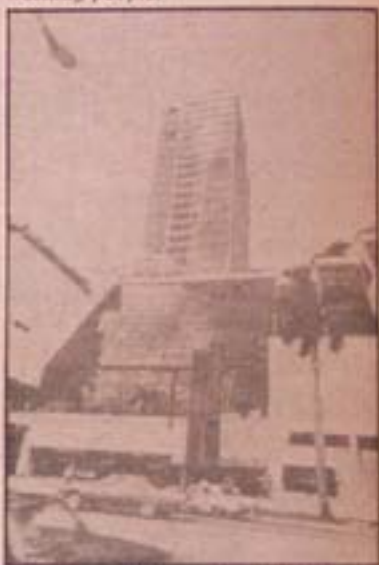
Shopping complex built to attract big business to Miami.

"I wouldn't mind paying an extra penny tax (referring to Florida Governor Graham's proposal to raise the sales tax one cent to raise $300 million to 'repair damage from the riots and rebuild the ghetto') to help 100 senior citizens.) I'd gladly give up a penny. That's my true opinion. We've all worked pretty hard. This has been a quiet neighborhood. We are a mixed neighborhood. There are Black families down the street and across the street. I have no objection to race. I'll tell you what the problem is. The judges and the higher ups. The higher ups are causing the problems, not the working people."