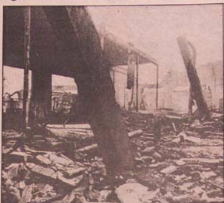
Tire plant burned down during the May rebellion of Miami's Black community.