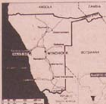
The United Nations is investigating the illegal mining of uranium in Namibia by the U.S. and other Western countries. Namibia is still ruled by South Africa in violation of a U.N. mandate.

In 1974, the council issued Decree No. 1, stating that no one may "search for," let alone "extract" or "export," as RTZ does, any natural resource of