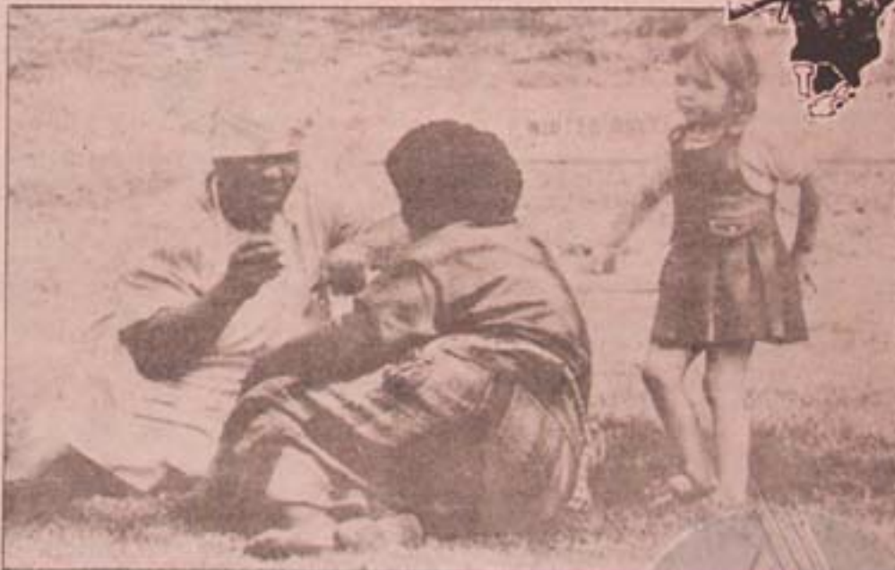
Black women in South Africa sitting on the ground, while White child is free to perch on park bench.

Council sources said that banning Blacks from using the parks would probably be their solution.