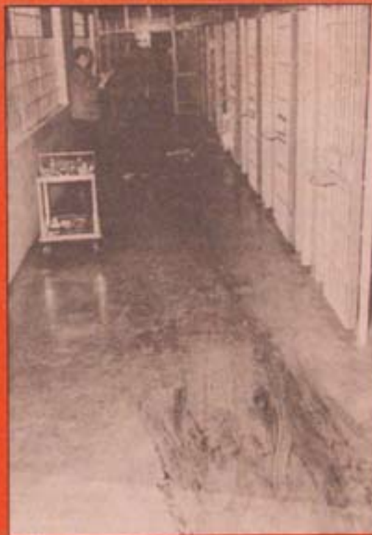
San Quentin Prison, August 21, 1971.