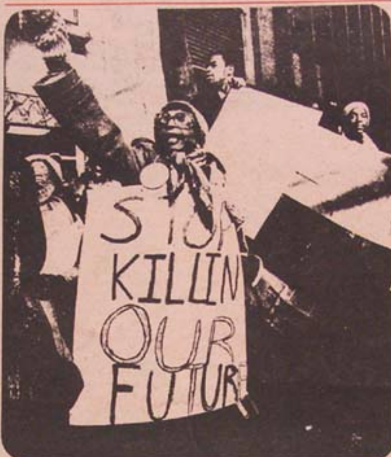
"We are still in 1980 a controlled people."

"To prevent financial cooptation of the Front by the White power structure, the constitution provides for